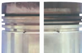
With FUCHS AGRIFARM

Significantly less wear = greater reliability and lower costs